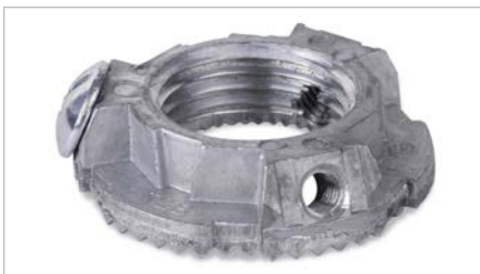
Grounding Locknut for Hubs

For Chrome Plated Hubs add suffix CP (i.e. H050GRCP) For 316 Stainless Steel Hubs add suffix SST (i.e. H050GRSST) For PVC coating add suffix PVC (i.e. H050GRPVC-C) Meets NEMA sealing requirements for NEMA 3R, 4 & 13 enclosures UL Listed and CSA Certified CSA approved for use in hazardous locations: Class I, Division 2, Class II, Divisions 1 & 2, Groups E, F & G, Class III, Division 1, 2 and Type 4.