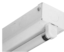
SV T5 Strip