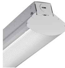
SV T5 Strip with lens accessory