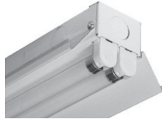
SV T5 Strip with symmetric reflector accessory