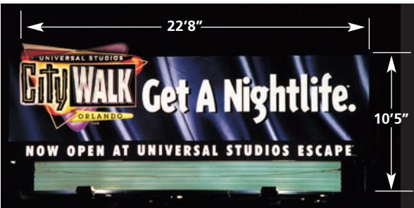
Two 400 watt Panel-Vue luminaires