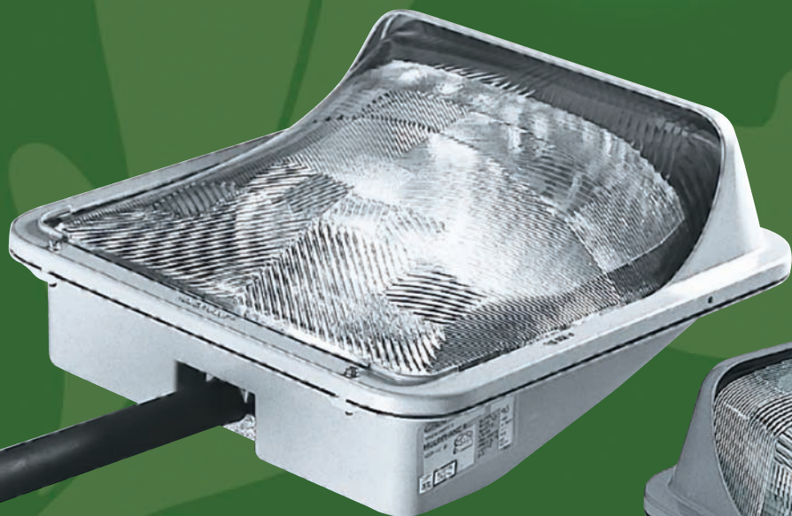
SIGN-VUE ® II

HOLOPHANE ® LEADER IN LIGHTING SOLUTIONS