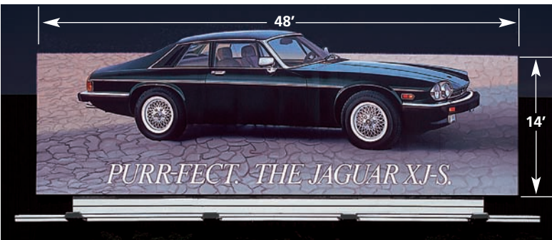
Four 400 watt Sign-Vue II luminaires