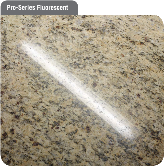
Pro-Series SoftTask™ LED mimics the look and light output of Pro-Series Fluorescent.