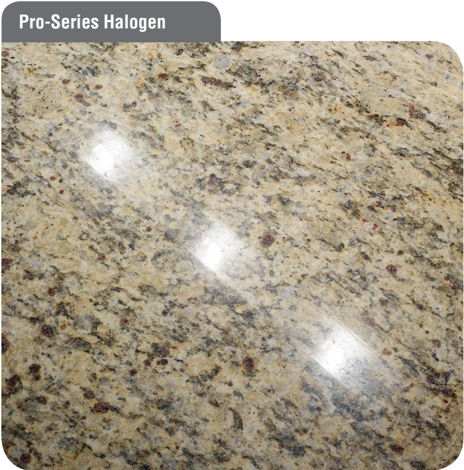
Pro-Series LED mimics the look and light output of Pro-Series Halogen.