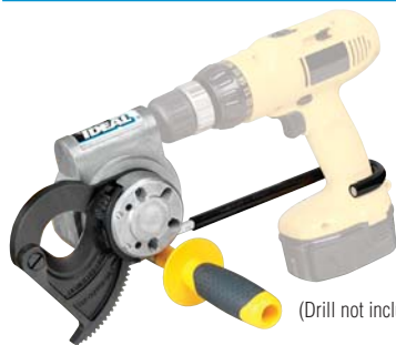
(Drill not included)