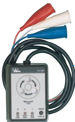
61-520 3-Phase Sequence