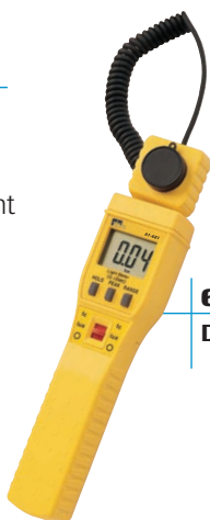
61-681 Digital Light Meter