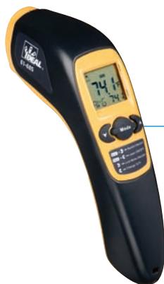
61-685 Infrared Thermometer