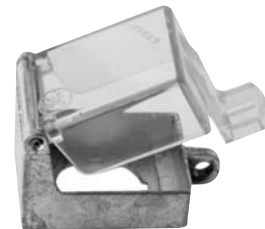
Padlocking Device with Clear Cover