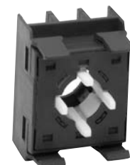
Push-on/ Push-off Device