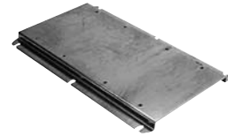
Starter Mounting Base