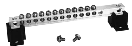
TGK12 with TGKIS