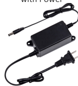
PFM321 Power Adapter