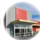
Big Box Stores