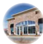
Small Power Distribution