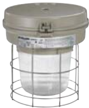
VM2LB with Globe/Guard

Expanded wattage range and shallower depth VM2LB models