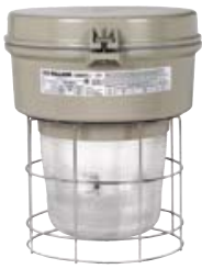
Globe & Guard or Glass Refractor & Guard