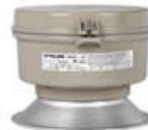
VM4LC with Flat Lens

Class I, Div. 2, Groups A,B,C,D Class I, Zone 2, Groups IIC, IIB, IIA Class II, Div. 1 & 2, Groups E,F,G Class III Suitable for wet locations NEMA 3, 4X IP66 Marine Rated (US only)