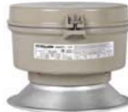
Spin-Top Poly or Glass Flat Lens VM4LC only