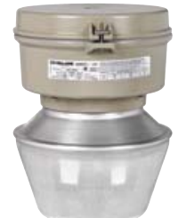
Spin-Top Poly or Glass Refractor