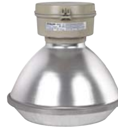
Poly Food Optic