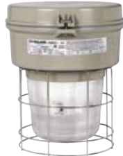
VM4LB with Globe/Guard