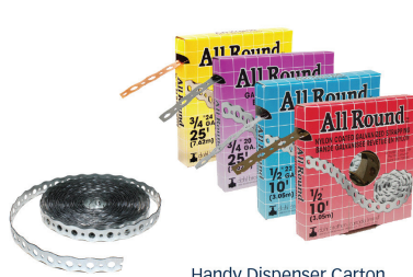
Handy Dispenser Carton