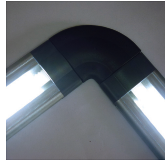
90° Direct Connector 1