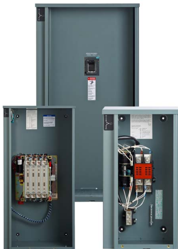
Covers have been removed for illustration.