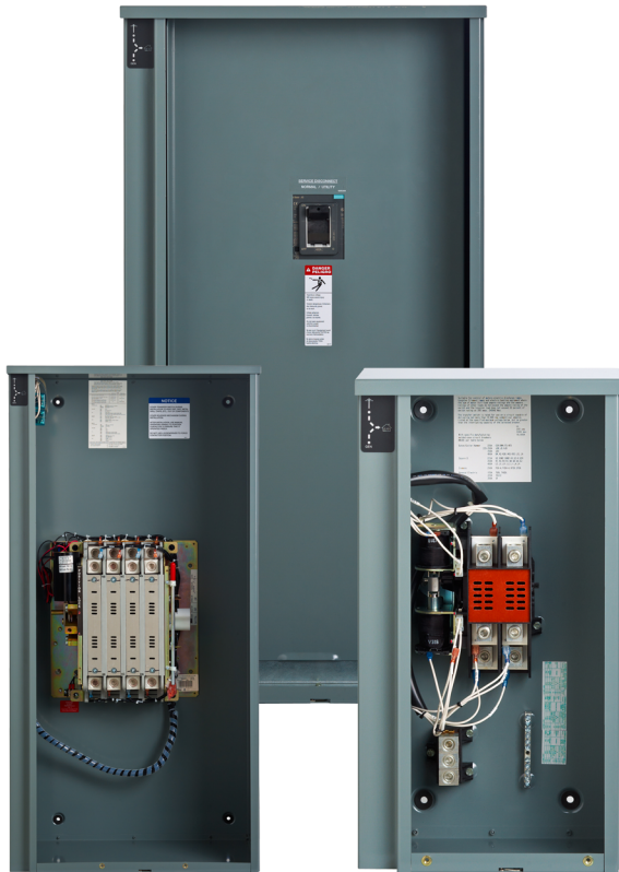
Covers have been removed for illustration.