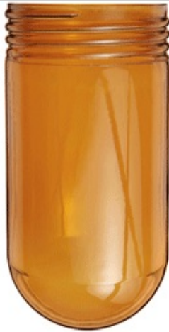
Threaded glass globes fit RAB and other standard Vaporproof fixtures and Lawn Lights Color: Amber Weight: 1.2 lbs