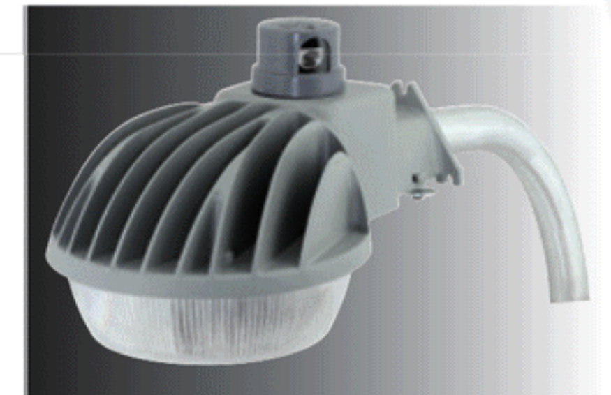
Shown with refractor installed