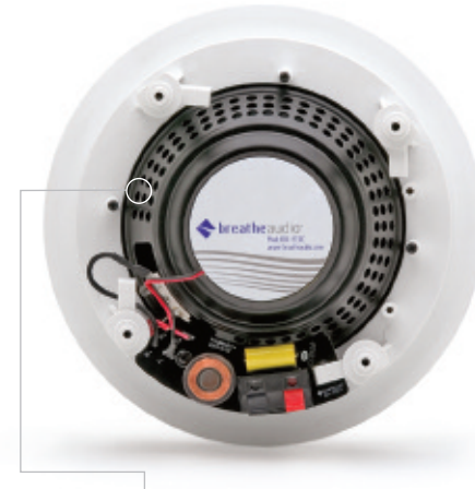
\begin{tabular}{ll} BA-650C \\ 6.5 \end{tabular} Ceiling Speaker with Co-axial Pivoting Tweeter \end{tabular}