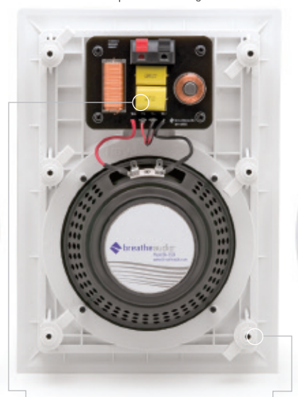
BA-650CS 6.5" Stereo Ceiling Speaker with Dual Fixed Tweeter