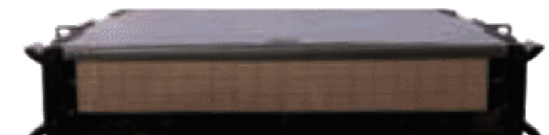
Front View, Labels