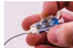
Insert and Click

Note: See page G14 for termination tools and accessories. Cleave tool OFCLV3 is suitable for multimode only. Visual Fault locator OFVFLKT1 recommended during termination. Precision cleave tool OFCLV4 or OFCLV5 is required for singlemode terminations. Use a precision cleave tool for optimum performance.