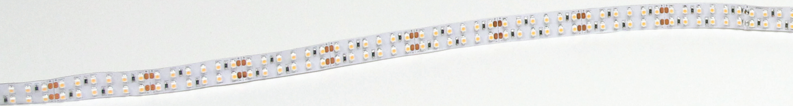
LTR1200-HO Ribbon Section

GM Lighting's New LEDTask 24VDC Super High Output Flexible LED Ribbon may be the brightest flexible LED linear ribbon on the market. The intense light output is perfect for areas that demand a strong and energy efficient light source. Available in 2700K Warm White, 3500K Warm White or 4200K Natural White.