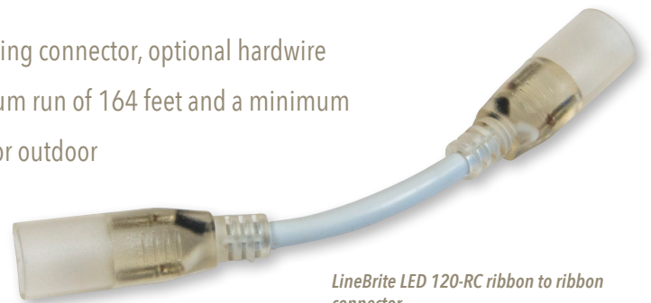
LineBrite LED 120-RC ribbon to ribbon connector.

GM Lighting's LineBrite LED features an optional flexible mounting connector, optional hardwire connector, and a 48" plastic mounting channel. With a maximum run of 164 feet and a minimum run of 19 inches, LineBrite LED is perfect for almost any indoor or outdoor linear lighting challenge.