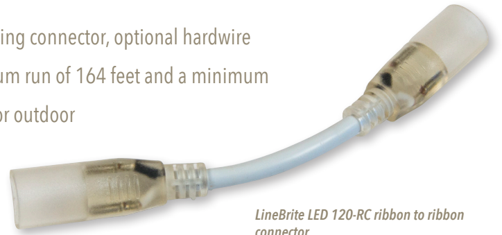
LineBrite LED 120V-RC ribbon to ribbon connector.

GM Lighting's LineBrite LED features an optional flexible mounting connector, optional hardwire connector, and a 48" plastic mounting channel. With a maximum run of 164 feet and a minimum run of 19 inches, LineBrite LED is perfect for almost any indoor or outdoor linear lighting challenge.