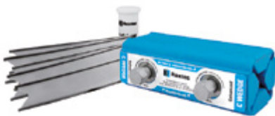
C Wedge kit galv

The wedge kit includes one Roxtec Wedge 120, five stayplates, one lubricant and installation instructions.