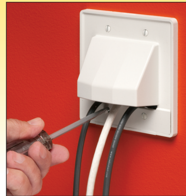
CER2 with Scoop facing OUT . Lower plate secured.

Each of our SCOOPs mounts directly to the wall with drywall screws. For added support, mount to one of Arlington's low voltage mounting brackets; LV1 to LV4.