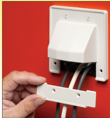
CER2 with Scoop facing OUT & lower plate removed.