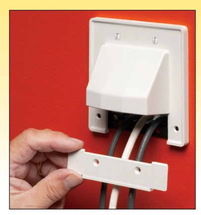
CER2 with Scoop facing OUT & lower plate removed.