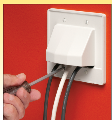
CER2 with Scoop facing OUT. Lower plate secured.

Each of our SCOOPs mounts directly to the wall with drywall screws. For added support, mount to one of Arlington's low voltage mounting brackets; LV1 to LV4.