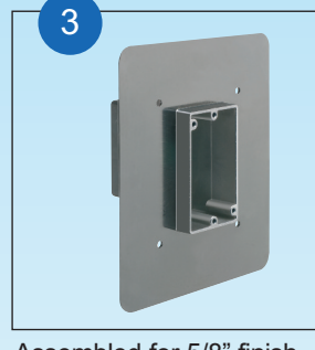
Assembled for 5/8" finish thickness.