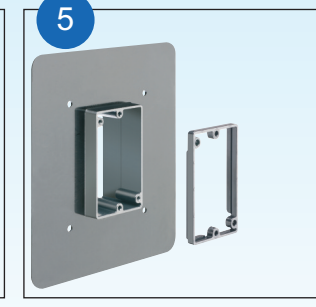
...to the front of the box.