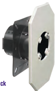
IN for Brick

Adjustable depth fixture box for new stone or brick. Adjusts to fit an exterior wall finish from 1-1/2" to 5" thick. Color: Paintable white face plate. Face plate is UV rated plastic for long outdoor life.