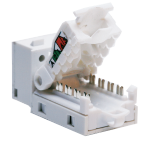
5ETLS-R*5 (rear view)

The HOME 5e Tool-Free Connector is designed to be used with all Leviton QuickPort<sup>®</sup> products. The connector supports high megabit applications such as Gigabit Ethernet. The connector features fast tool-free termination in residential applications.