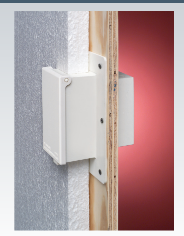
Saves Time-Looks Great!