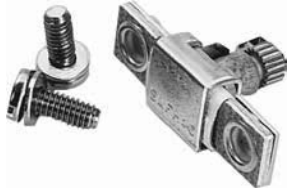
Heater Elements Class SMF