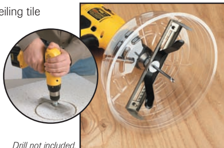
Drill not included.