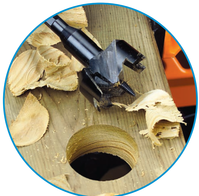
Quickly powers through wet and treated woods with no binding or jamming.