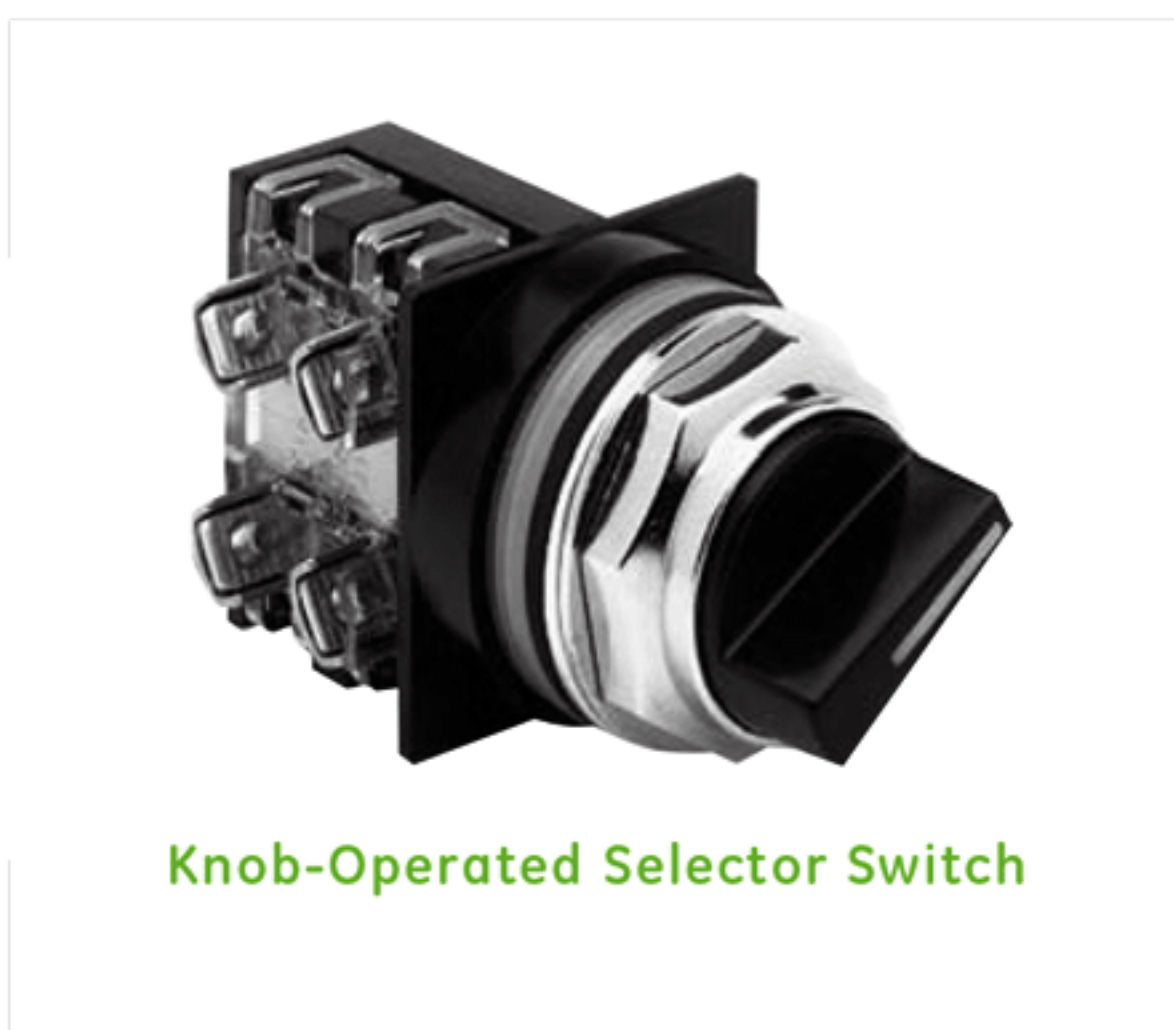
Knob-Operated Selector Switch

Suitable for use in NEMA Type 1, 3, 3R, 4, 4X, 12, and 13 applications, when mounted in enclosures rated for those same applications. For some NEMA Type 4X applications, protective caps will improve corrosion resistance.