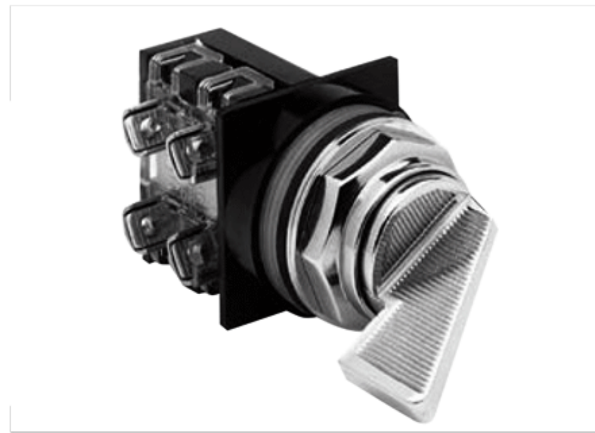
Lever-Operated Selector Switch

Suitable for use in NEMA Type 1, 3, 3R, 4, 4X, 12, and 13 applications, when mounted in enclosures rated for those same applications. For some NEMA Type 4X applications, protective caps will improve corrosion resistance.