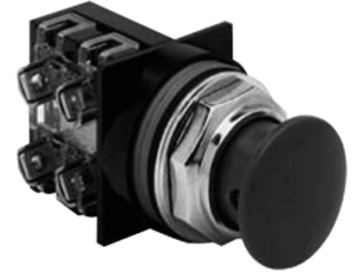
1 3/8" Mushroom Head