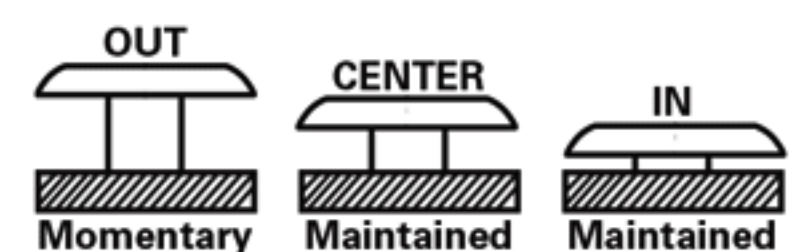
Maintained Push - Momentary Pull