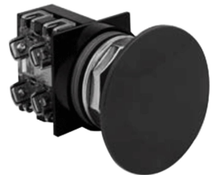
2 3/8" Mushroom Head