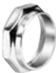
CR104PXG07 Octagonal Mounting Ring for Non-Illuminated Selector Switches, Joysticks and Potentiometer Operators