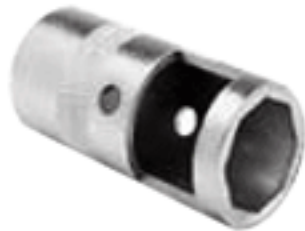
CR104PXG104 Octagonal Ring Wrench