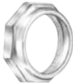
CR104PXG01 Octagonal Mounting Ring for Standard Flush and Mushroom-Head Push Buttons, and Push to Test Pilot Lights