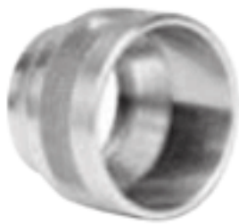
CR104PXG14 Mushroom-Head Guard