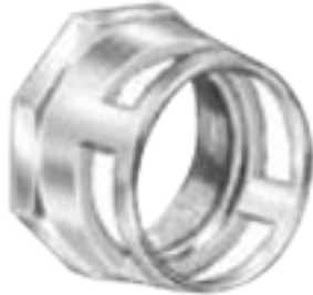
CR104PXG04 Octagonal Mounting Ring for Guarded Illuminated Push Buttons