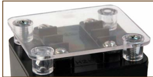
Clear Plastic Cover