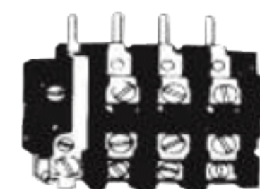
200-Line Block Overload Relay