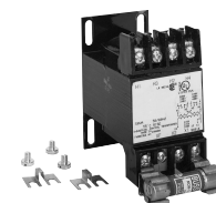
Control Power Transformer