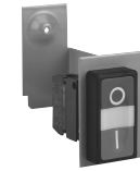
Start/Stop Push Button with Light