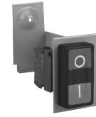
Start/Stop Push Button without Light