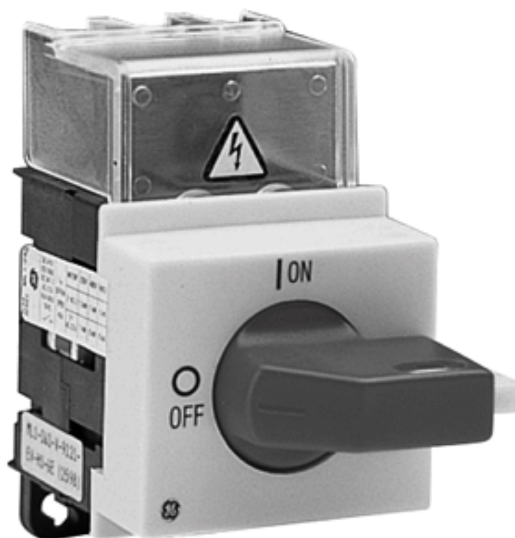
Rear Panel or DIN-rail Mount, Locking Lever