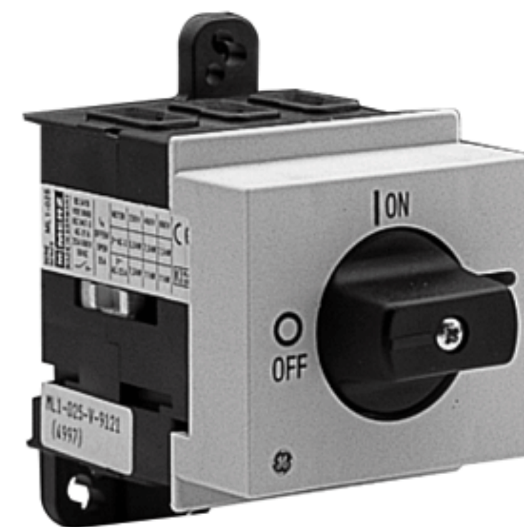
Rear Panel or DIN-rail Mount, Standard Lever