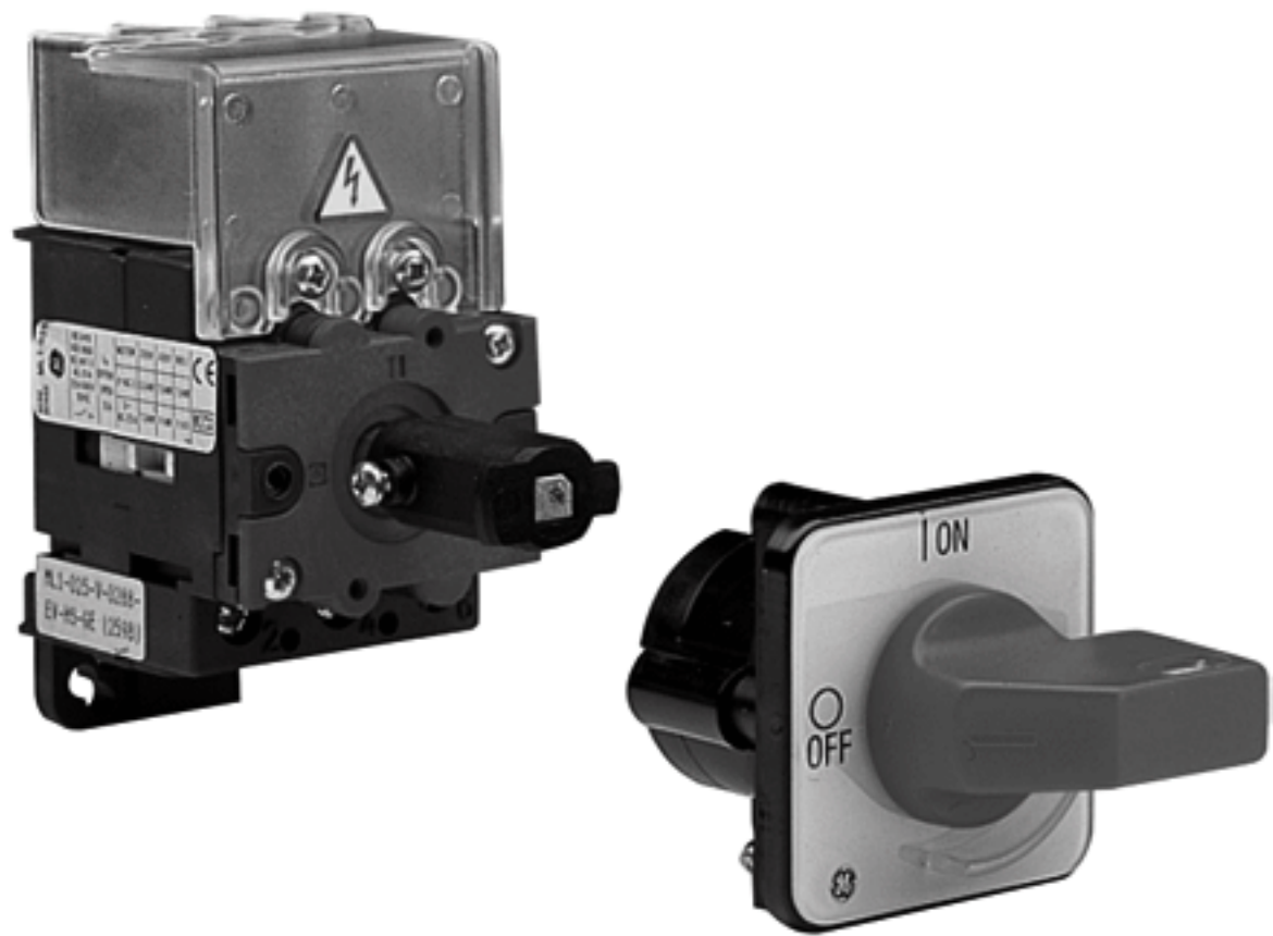
Door Coupling, Locking Lever