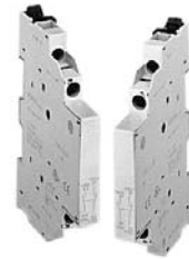
GPAC__LLA/GPAC__LRA Side Mounted Auxiliary Contacts