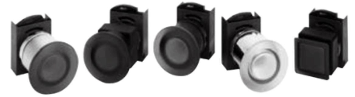
Illuminated Special Function Push Buttons