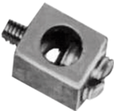
Load Lug THQEL3