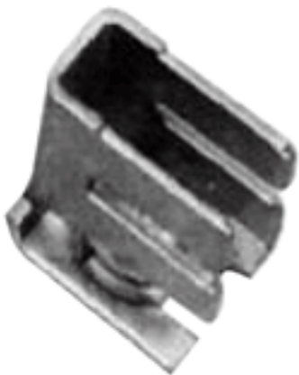
Quick Connector THQECC