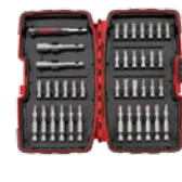
40 Pc Drive Guide Set 48-32-1505