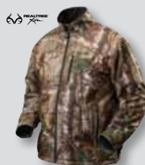
Realtree Xtra® Camouflage (2342, 2343)