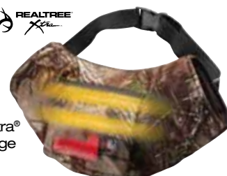
Realtree Xtra® Camouflage (2321)