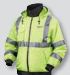
High Visibility (2346, 2347)