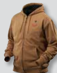
Khaki (2374, 2375)