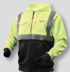
High Visibility (2376, 2377)