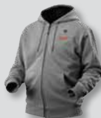
Gray (2372, 2373)