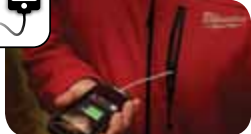
In-Pocket USB Port