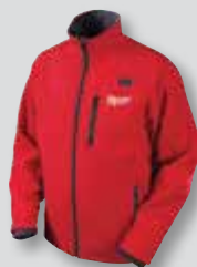
Red (2340, 2341)