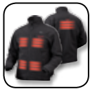
Distributes Heat to Core Body Areas and Pockets