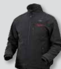
Black (2344, 2345)