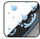
Water and Wind Resistant