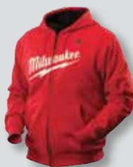
Red (2370, 2371)