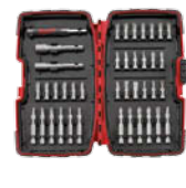
40 Pc Drive Guide Set 48-32-1505