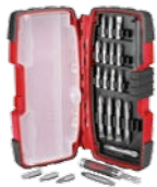
21 Pc Driver Bit Set 48-32-0221