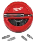
21 Pc Drive Guide Set 48-32-1700