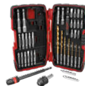
38 Pc QUIK-LOK™ Drill and Drive Set 48-32-1500