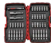
40 Pc Drive Guide Set 48-32-1505