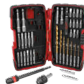
38 Pc QUIK-LOK™ Drill and Drive Set 48-32-1500