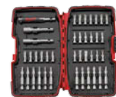
40 Pc Drive Guide Set 48-32-1505