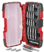
21 Pc Driver Bit Set 48-32-0221