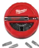
21 Pc Drive Guide Set 48-32-1700