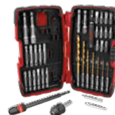
38 Pc QUIK-LOK™ Drill and Drive Set 48-32-1500